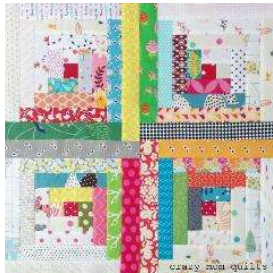
Log Cabin Quilt