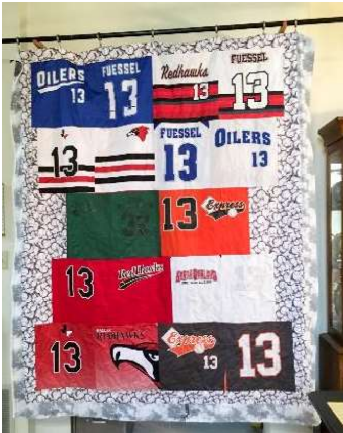
Stacy Young, whipped out some good looking t-shirt quilts

Thank you all for providing pictures for Show and Tell!