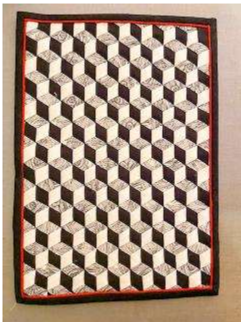
Examples of woven Fabric Tumbling Blocks

We will also have a workshop called Woven Fabric Tumbling Blocks on Saturday, June 5. Monica teaches how to weave fabric without sewing. If you are interested in signing up for this workshop, please send me an email at mneymman58@gmail.com . I will provide you with a supply list. She also makes a kit that includes everything you need for $30. Just let me know which you prefer.