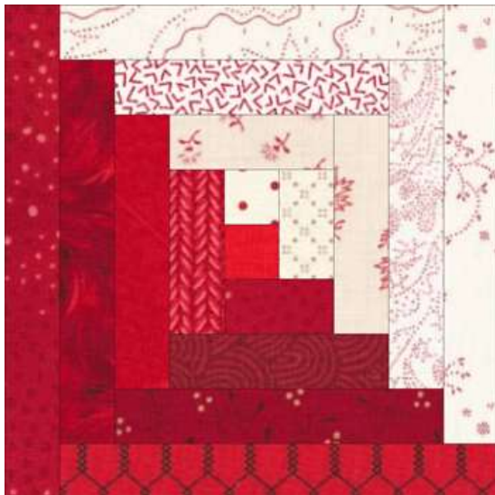
Log Cabin Bock

We will be making a Log Cabin Quilt. Minimum size is 63" X 63". Good Luck to everyone!